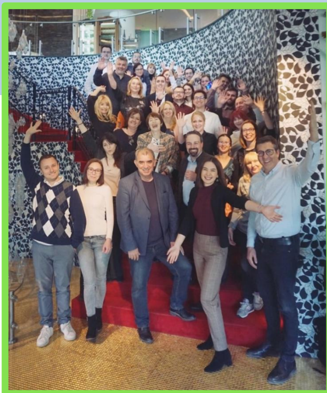
IMPULSE TEAM during last face-to-face meeting in Montenegro in February 2020 (before the COV-19 pandemic was announced)

The project started in April 2018. Recently the project has been extended for 6 months and the end-date is 30 th September 2021. We have by now completed data collection for all studies within the project and currently the focus is on analysis, write up and dissemination.